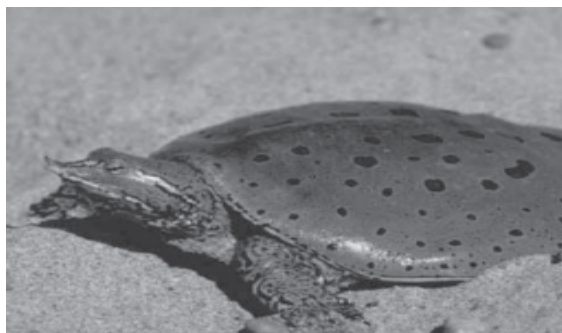
eastern spiny softshell turtle

Special Concern: A species is of special concern because of characteristics that make it particularly sensitive to human activities or natural events.