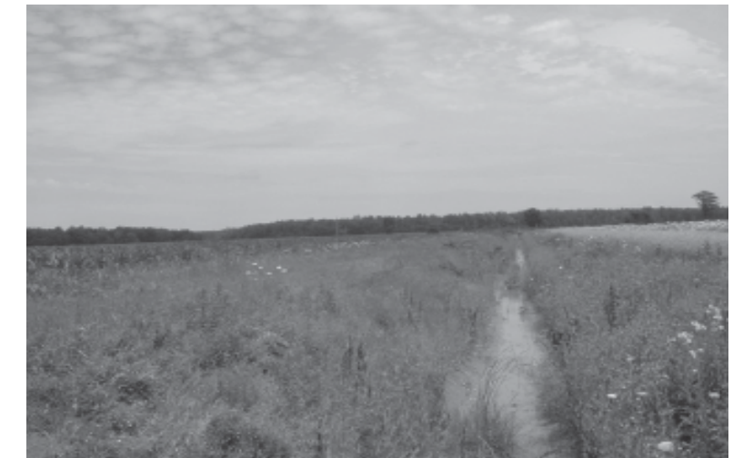
A buffer strip helps to reduce sedimentation and reduce the frequency of drain cleanouts.