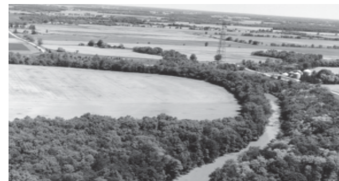
While a forested buffer is ideal along a major watercourse, buffers along a municipal drain should allow for access for maintenance.

* Warm-season native grasses shouldn't be planted in a mix with cool-season grasses