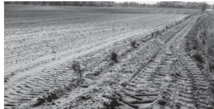
Trees planted along one side of the drain helps to provide shade for the stream, improving water quality.