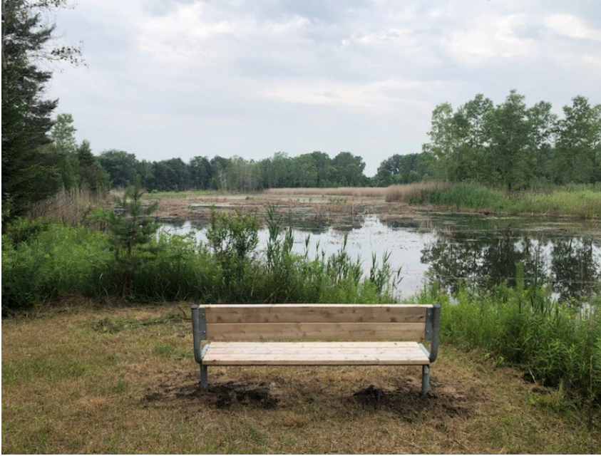
New rest bench at Marthaville Habitat Management Area (memorial bench donation)