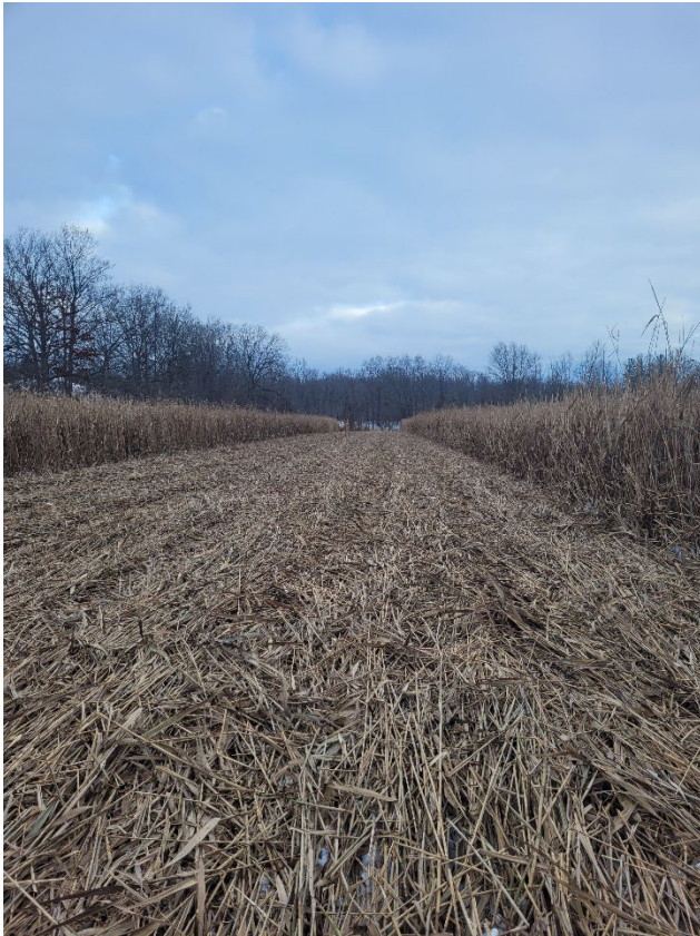
Invasive Phragmites after drone application of herbicide and during rolling at Warwick CA